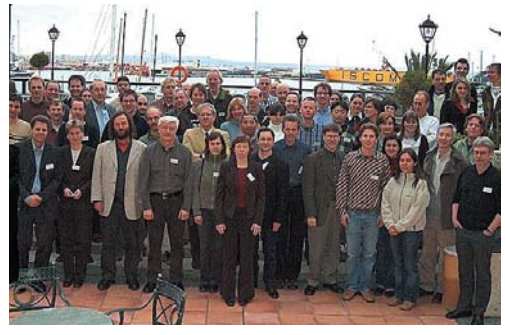
Kick-off meeting in Palma