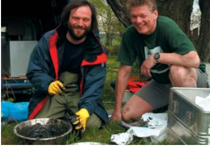
Sediment sampling at the River Elbe in P_elou_ (Czech Republic)

the UFZ Centre for Environmental Research in Leipzig (Germany) have come together for 5 years to develop and integrate advanced analytical and bioanalytical tools as well as interlinked and verified diagnostic and predictive models to unravel causal relationships between contamination and ecological quality and to assess risks to aquatic ecosystems. This goal is being addressed by looking at the three example river basins of the Llobregat (Spain), the Scheldt (France, Belgium and The Netherlands), and the Elbe (Czech Republic and Germany) and is to be achieved by two closely interlinked approaches: