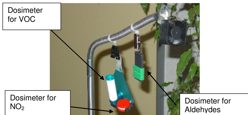
Figure 1: Indoor Measurement Set-Up

Except for particulate matter, all pollutants were measured for 7 days by diffusive sampling techniques. Particulate matter was measured by Grimm dust, Buck or Aeromini monitors (filter and optical techniques). The measurements were performed in line with the ISO-16000-x series